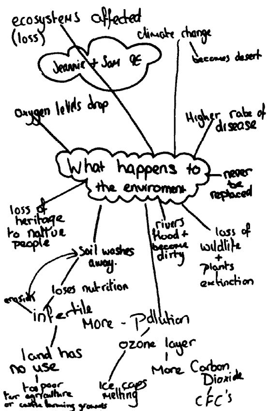
Figure 1 Responses from some of the most assured students to the question 'What happens to the environment when an area of Tropical Rainforest is removed?'

These activities produced interesting results. Examples of some of the most