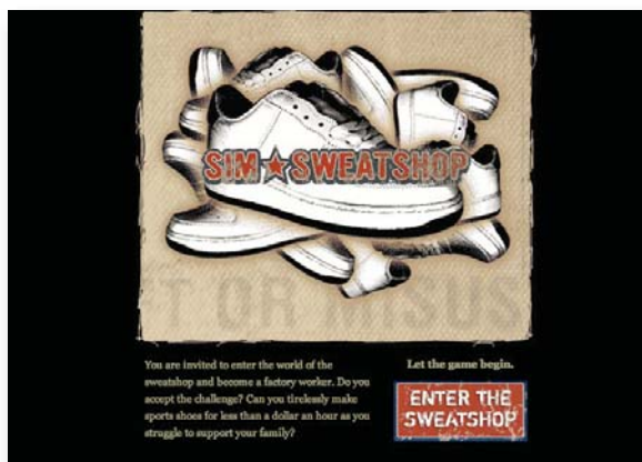
Figure 1: The SimSweatshop website.

If we return now to Ras Jebel and investigate the geographies of jean production in more detail we see that this tiny, busy node is just one moment in a much more extensive journey for our pair of jeans. It is here that dozens of different components converge and are transformed: the cotton is grown in Benin, West Africa; the raw denim comes from Milan; the indigo with which the denim is dyed comes from Frankfurt; it is stonewashed with pumice from Turkey; the thread is made in Northern Ireland, Turkey and Hungary and is dyed in Spain; the rivets and buttons are manufactured from zinc and copper from Australia and Namibia. And these components in turn raise a whole series of questions about the real social, economic and political costs incurred in the making of a pair of jeans: stonewashing produces several tons of powdered pumice each year that is discarded in Tunis; indigo leaches into local streams and kills plants and fish; Benin's cotton industry is haunted by corruption and mismanagement, its labour is hard, the rewards slight and people are dying from insecticide and pesticide poisoning (Abrams and Astill, 2001). A pair of jeans uses three-quarters of a pound of pesticides and synthetic fertilisers (Harkin, 2007). Pollution from the copper mines in Namibia is toxic, but concern about the environmental and health impacts is a luxury when the alternative is no job and no income.