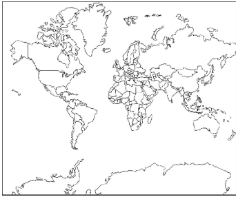
Figure 1 The Mercator projection