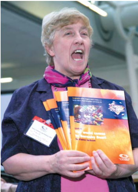
Excellence and enjoyment – launches of the Primary Geography Handbook, SuperSchemes and Geography from Square One underlined the high priority the GA gives to supporting primary teachers