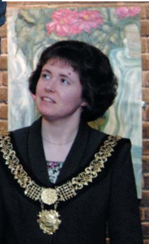
Forging stronger links with the local community, via the Civic Reception and the Derby visits, is a definite for future Conferences