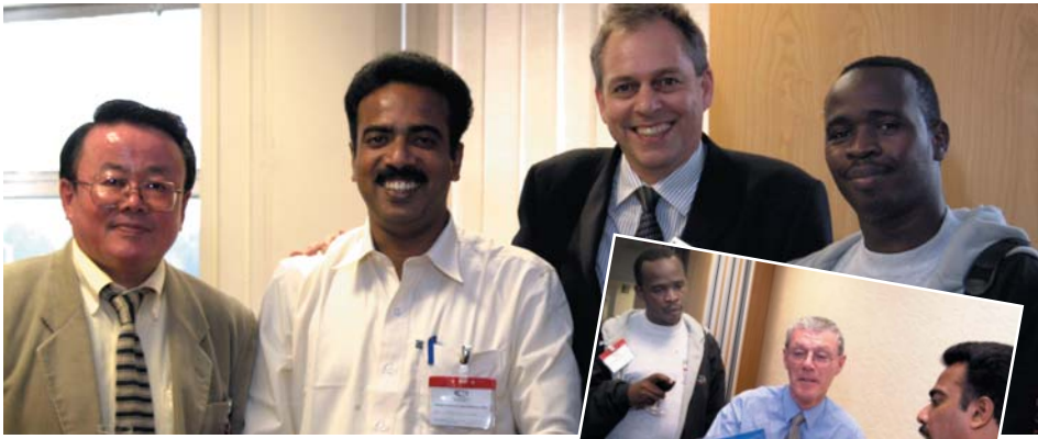
The long-established International Rendezvous was as popular as ever.

Seeing so many of our members in Derby confirmed our belief that the Annual Conference offers the best value CPD. Next year we'd like to see even more of you! Planning for Manchester 2006 (19-20 April) has already begun and we would greatly value your input, after all, it is your Conference! What would you like to see included in the programme? What type of speakers would attract you? How can we keep improving the Conference experience? In essence, what would make you come along?