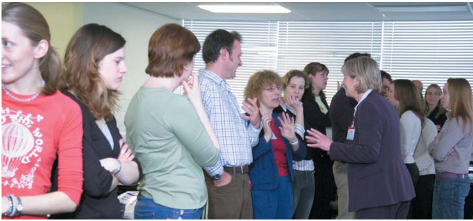
Workshops were judged of very high quality and relevance