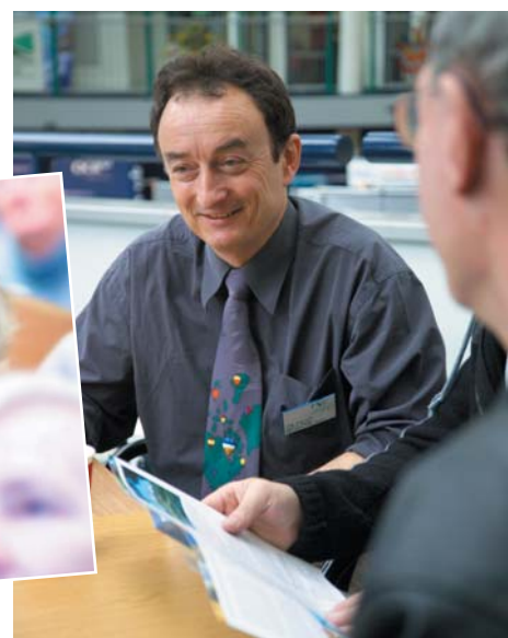
Teacher-to-teacher sessions were a refreshing and informal aspect of this year's event and the 'new to Conference' breakfasts went down well!